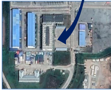
O&M Admin Office