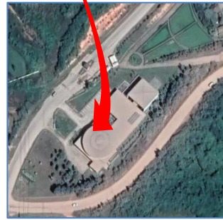
Hongkham Xaiyakarn Building